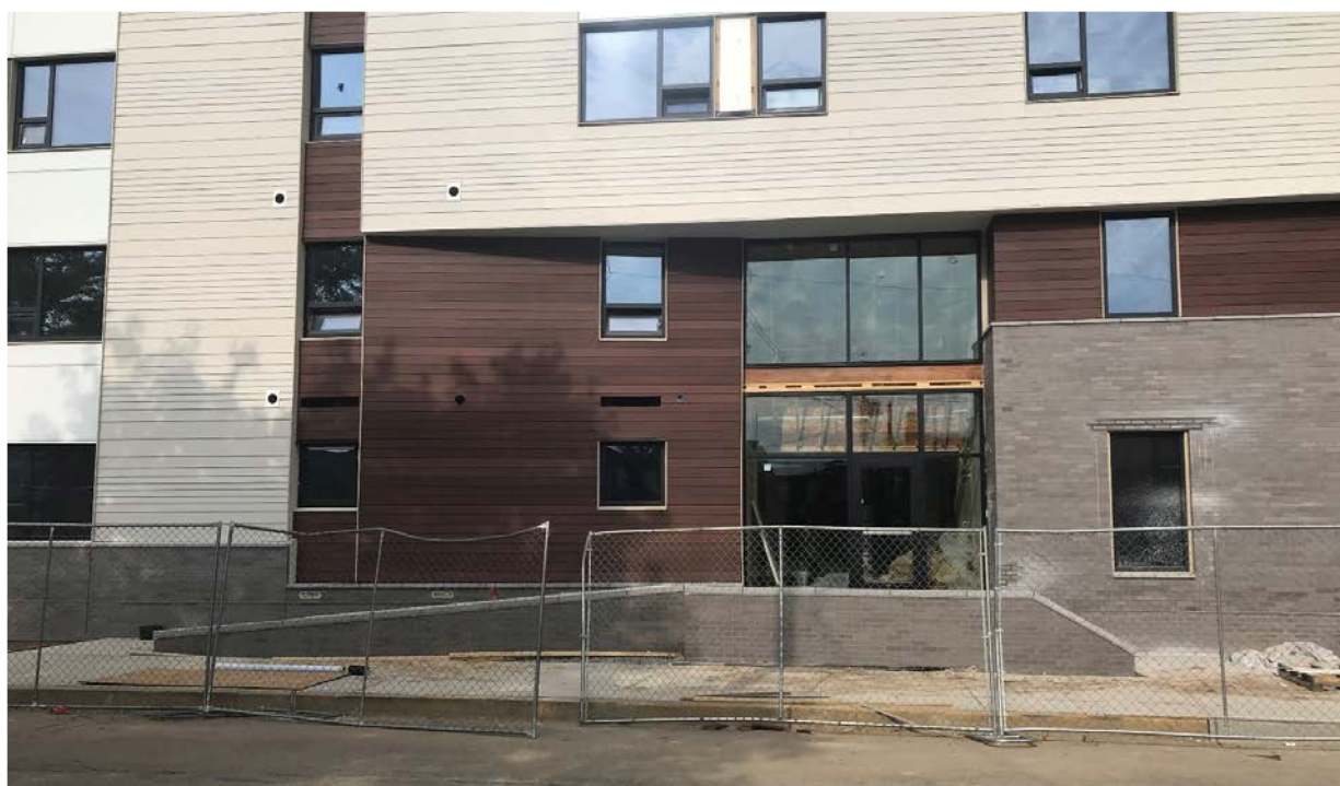
Front door of Pioneer Apartments have been installed with the two story glass window.