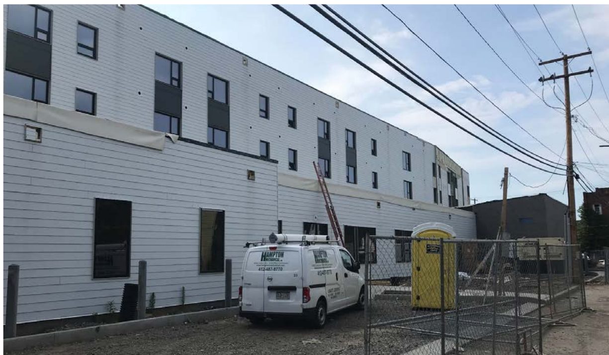
Rear view of the offices.