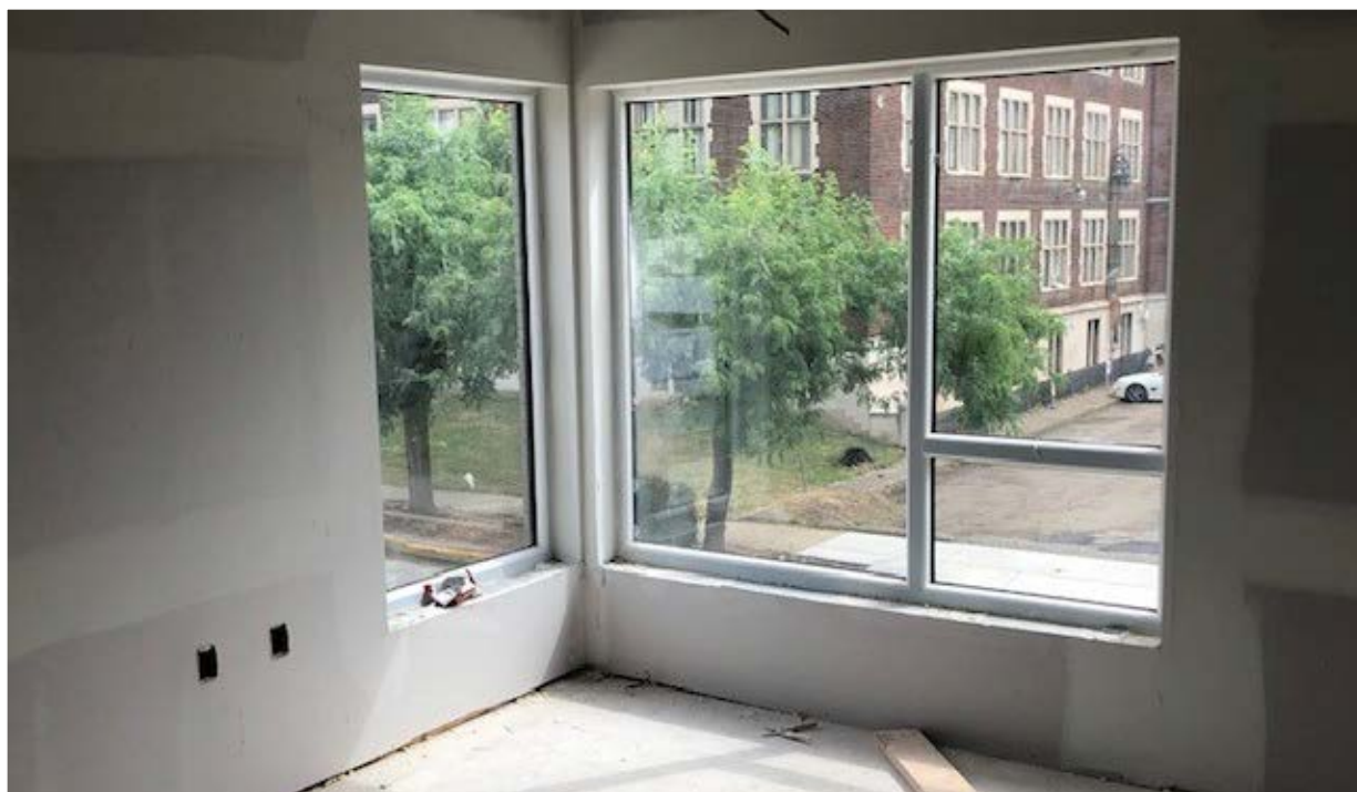
2nd Floor corner office facing 4th Avenue.