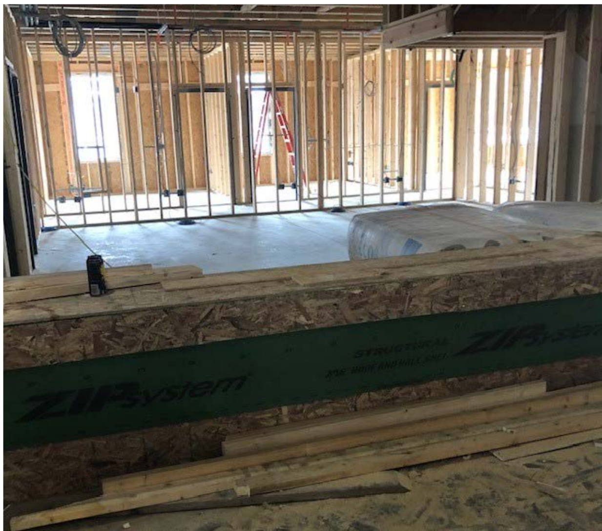
2nd floor waiting room, looking into the reception office and offices behind that. Comcast brought internet service into the utilities room on the offices side on Friday.