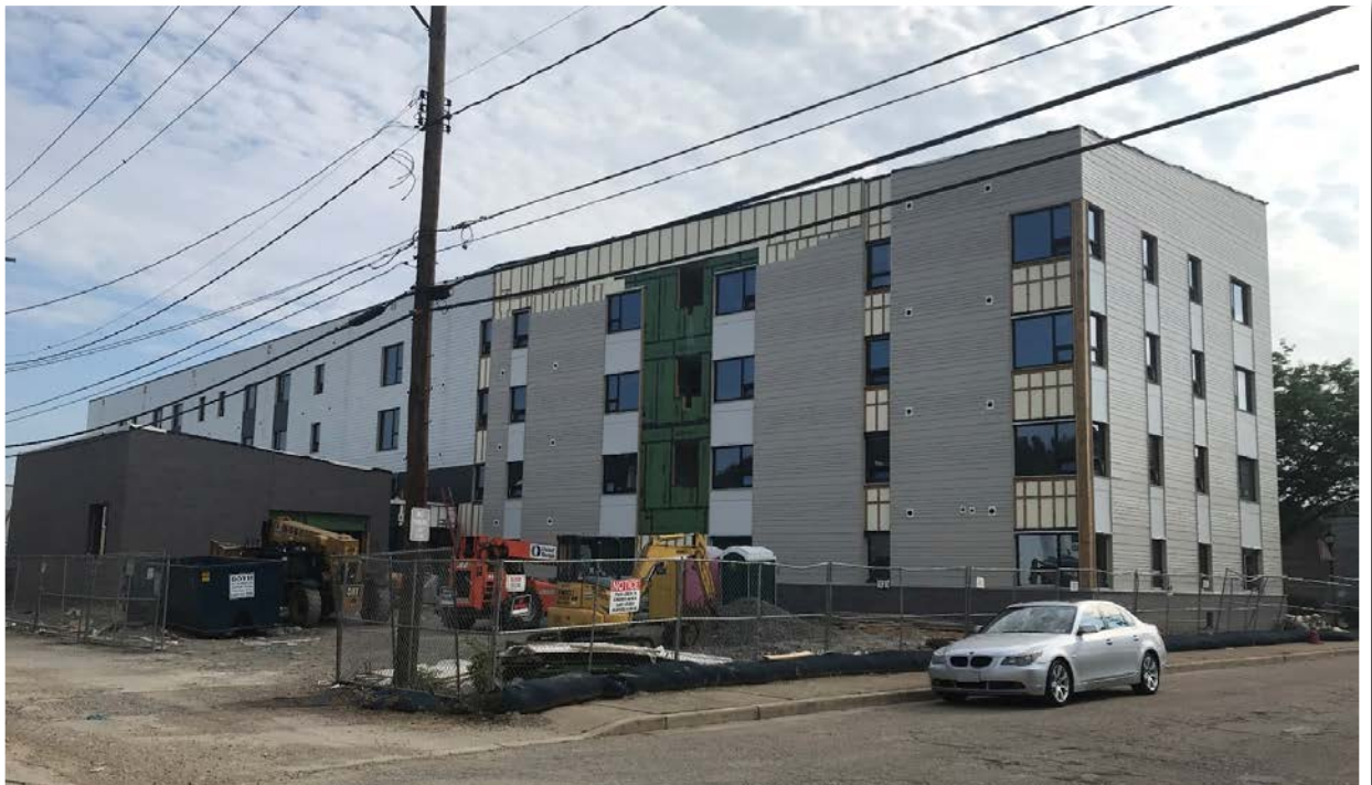
10th Street view. The Community Room is the dark brick part of the building on the left of the picture. The final siding is being put on the back of the apartment side of the building. Flooring has begun to be installed on the fourth floor along with the interior doors. The kitchen and bathroom cabinets are being installed on the third floor. Interior insulation has been installed on the second floor and passed inspection. Dry wall is beginning to be put up on the second floor and will be done by the middle of next week. The cement (gypcrete) floors have been poured on the 2nd floor this week.