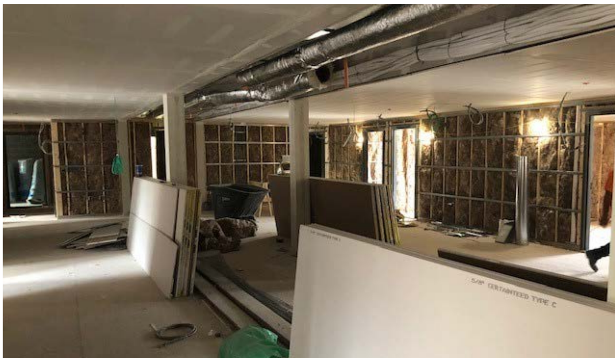
2nd Floor area for mobile staff. The concrete (gypcrete) floor will be poured this week. The HVAC inspection is scheduled for this week. Dry wall is beginning to be put on in the offices on the second floor and mudding will begin this week.