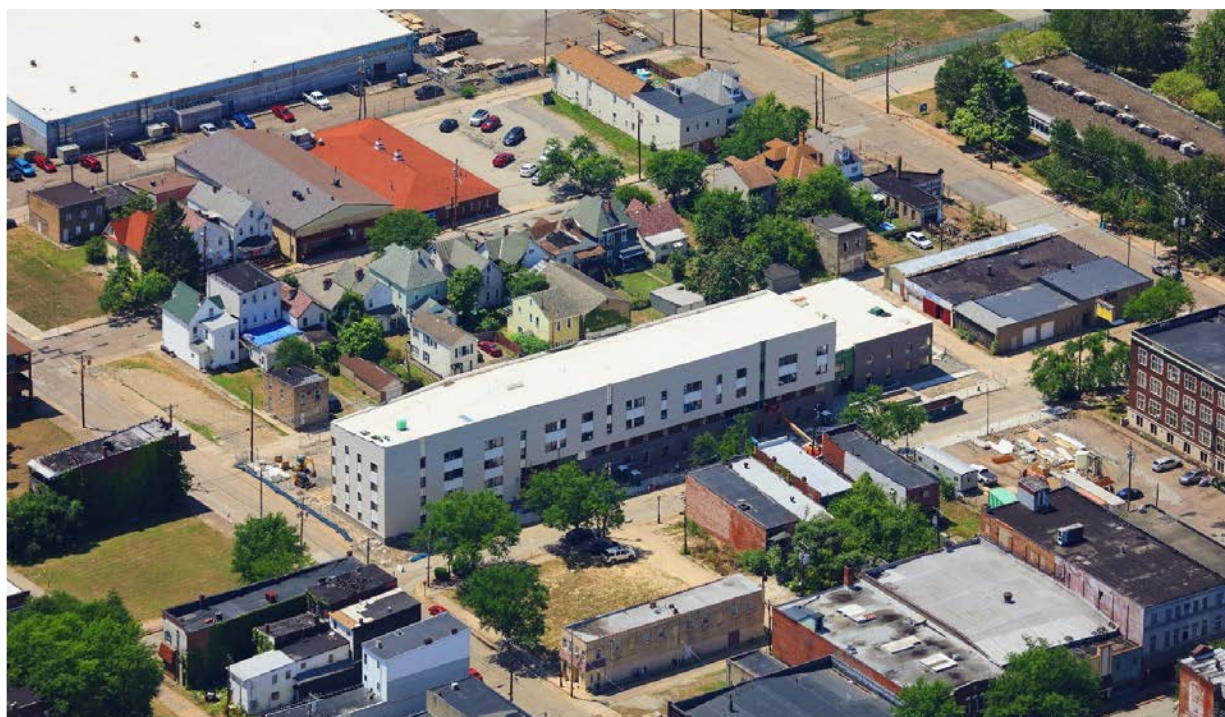
Aerial picture of the front side of the building. Apartments on the four floors on the left side of the picture. The offices have a red siding and brick to distinguish that part of the building as Wesley Family Services offices.