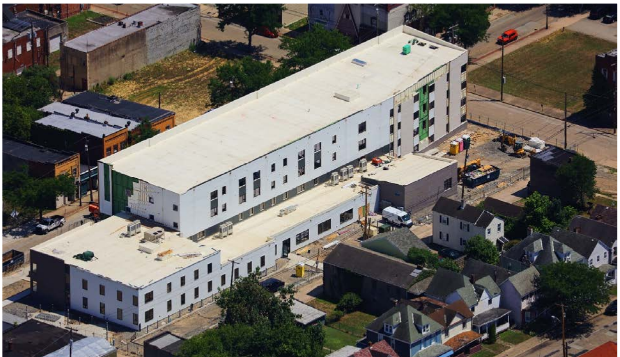
Aerial view of the rear of the building. The Community Room is the dark brick structure on the right side of the building.