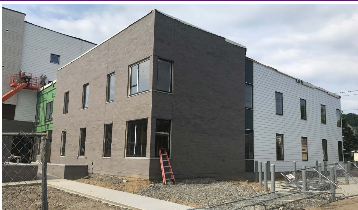
View of the ramp up to the front door of the WFS offices.